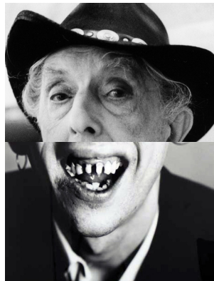
Quentin Crisp Shane McGowan