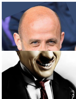
Gary McAllister Charlie Chaplin (died)