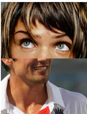
Helena Christensen Alistair Cook