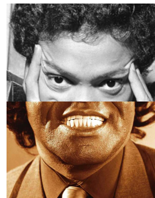
Eartha Kitt (died) James Brown (died)