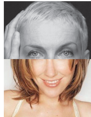
Annie Lennox Dido